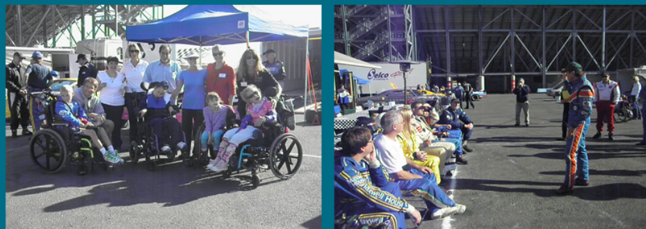
Left: Boost Camp kids with parents and UCPNB staff. Right: ROYL riders getting prepped for the ride.

Supporting UCP of the North Bay Therapeutic Recreation Services