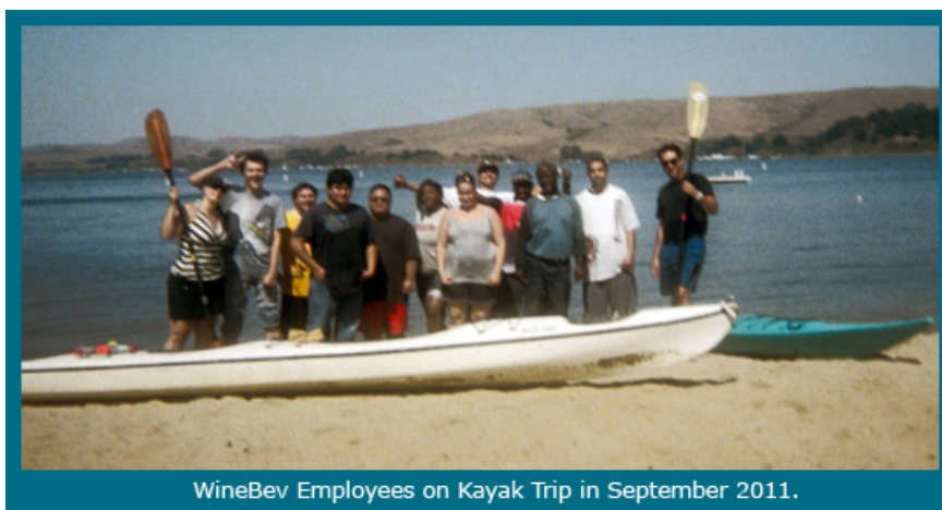
WineBev Employees on Kayak Trip in September 2011.

These annual trips have been very successful, with our employees at WineBev Services using their earnings to pay the $50 activity fee. Outdoor adventure programs provide an outstanding opportunity for participants to build self-confidence and self-esteem through cooperative activities.